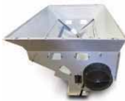
EBM Manufacturing aspirator.

“Consumers want super-clean, debris-free products, and the EBM Manufacturing aspirator is capable of removing lighter-density materials that are similar in size to the grain